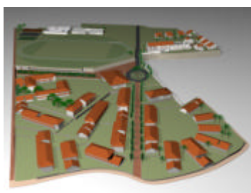
Plans for the future

http://www.plan-lanka.lk/html/TsunamiFeature_ruhunuschool.shtml