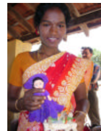
Creativity at work