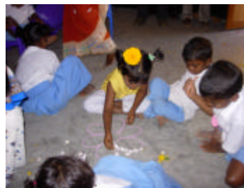
Learning through play