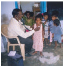
Visiting the doctor